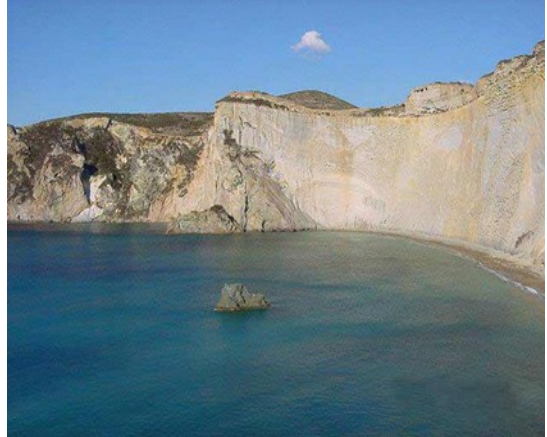
Ponza: Moon Bay

Sea depths are often changing and very charming.